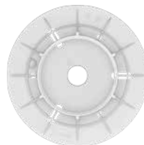
Ø 205 mm