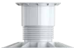
1 x K4