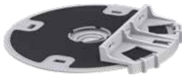
King Joist Cradle