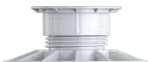
1 x K3