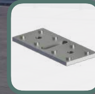
DuraFix Z Vario