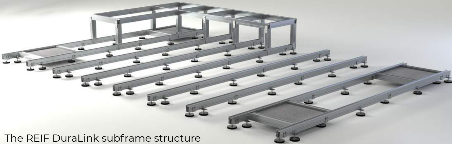
The REIF DuraLink subframe structure

We're here to help. info@alfrescofloors.co.uk www.alfrescofloors.com