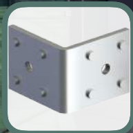
DuraFix Z 90