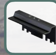
DuraClip Z 1