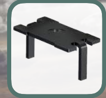
DuraClip Z 2