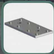
DuraFix Z 180